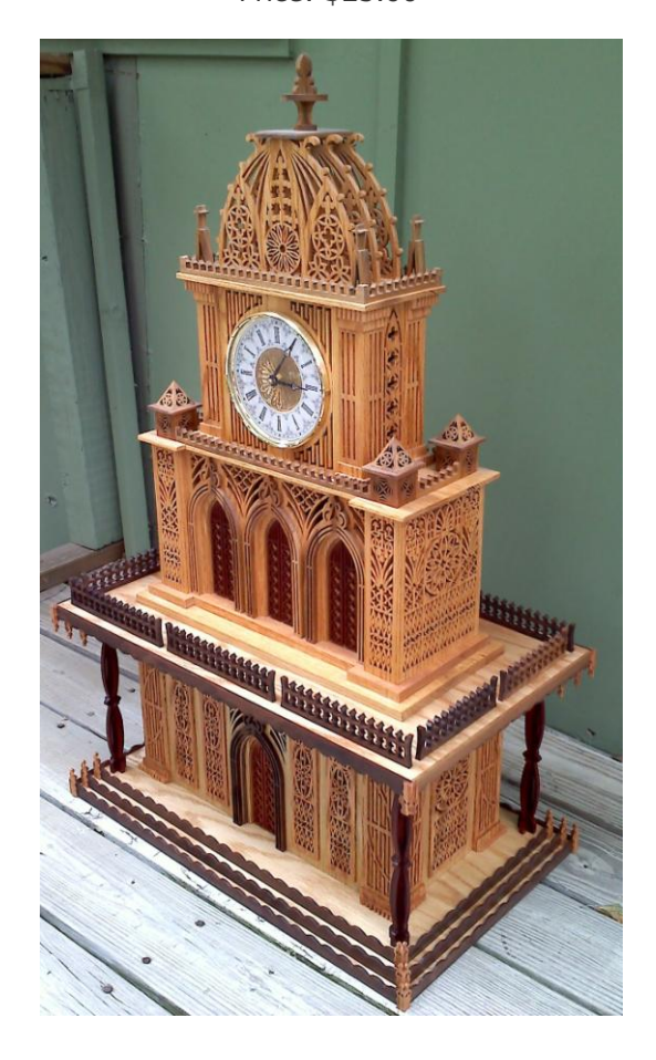
Orleans Cathedral Clock & Base Combo Price: $50.00

Size: 24" Wide x 14" Deep x 12" Tall Description: This is a medium challenging base designed as a Memorial to Wilckens Woodworking Founder Raymond Wilckens and intended to be used as a Base for the Orleans Cathedral Clock but can be its own stand alone project. Price: $25.00